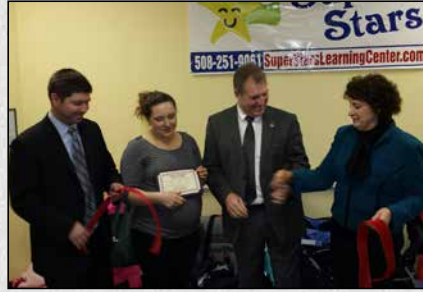
Ribbon Cutting for Super Stars Learning Centers