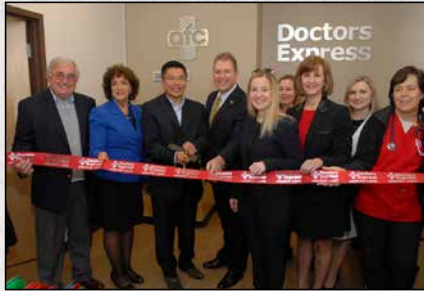
Ribbon Cutting for Doctors Express