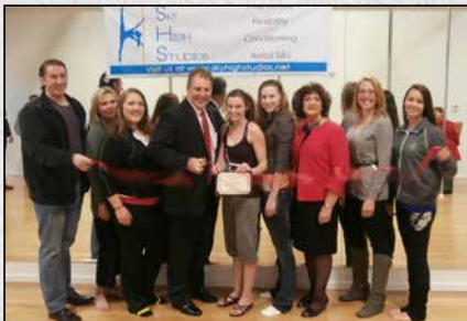
Ribbon Cutting for Sky High Studios