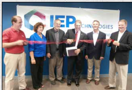
Ribbon Cutting for IEP