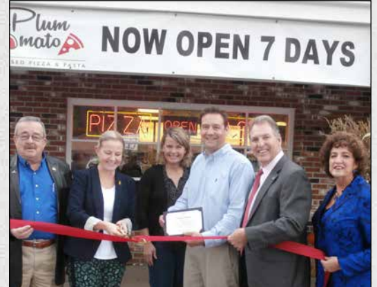
Ribbon Cutting for The Plum Tomato