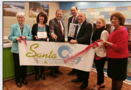
Ribbon Cutting Santa Cruz Deli & Creamery