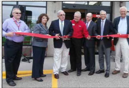
Ribbon Cutting for Savers