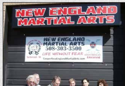
Ribbon Cutting for New England Martial Arts