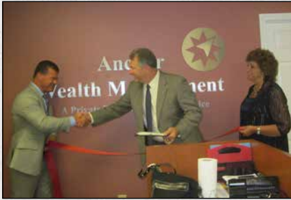
Ribbon Cutting for Anchor Wealth Management