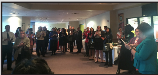
Pictured Above: Health & Wellness Expo at ForeKicks Marlborough