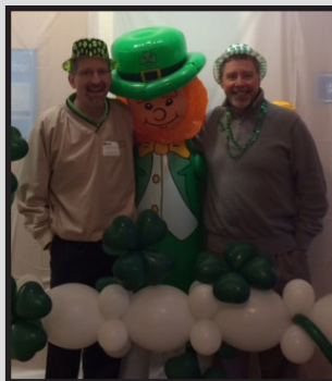
Pictured Above: Folks from EES at St. Patrick's Day Party