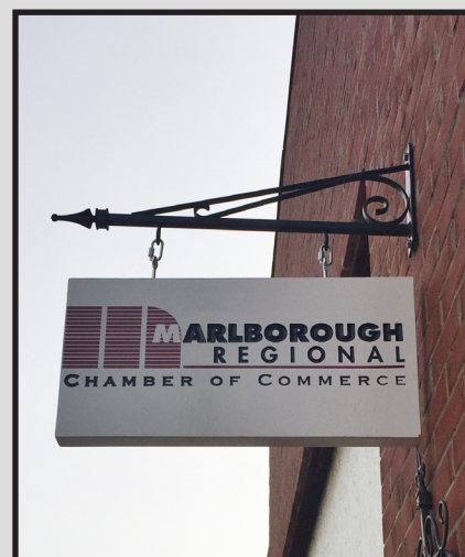
Pictured Above: Our Brand New Outdoor MRCC Sign!