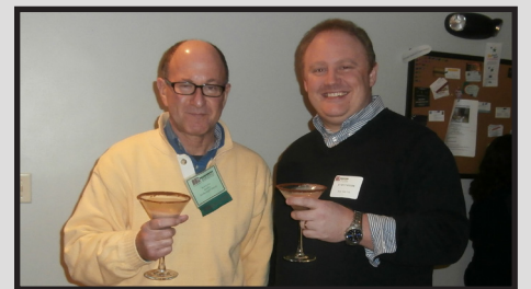
Pictured Above: DruMais Hair Salon Night at the Spa event