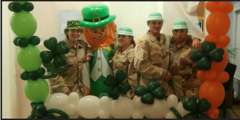
Pictured Above: Assabet Valley JRROTC at St. Patrick's Day Party at Bell Marlborough