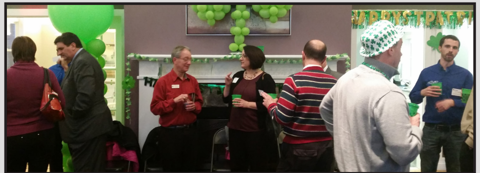
Pictured Above: St. Patrick's Day Party at Bell Marlborough