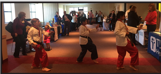
Pictured Above: Health & Wellness Expo at ForeKicks Marlborough