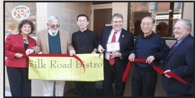
CONGRATULATIONS & WELCOME! Member: Silk Road Bistro