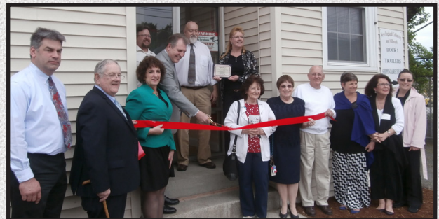
CONGRATULATIONS & WELCOME! Member: TC Life Safety