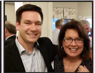
Pictured Above: Business After Hours with Corridor Nine at Whitney Place