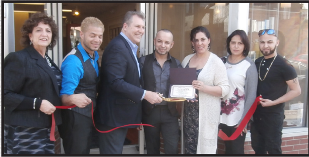
CONGRATULATIONS & WELCOME! Member: Cesars Hair Salon & Spa