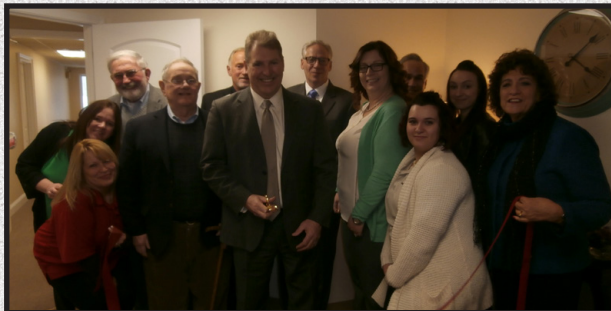
CONGRATULATIONS & WELCOME! Member: Rogers Hearing Solutions