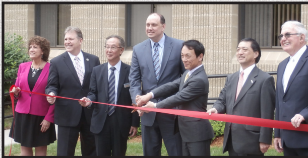
CONGRATULATIONS & WELCOME! Member: Mitutoyo