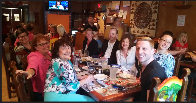
Pictured Above: NITE out at Zarape with the Ambassador Committee and the RYP Committee