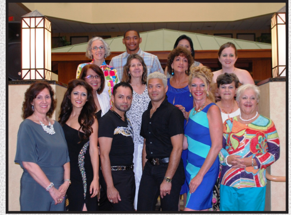
Pictured Above: Womens Business Council Lunch & Fashion Show at Embassy Suites