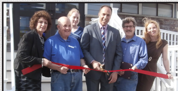
CONGRATULATIONS & WELCOME! Member: Marlboro Animal Hospital