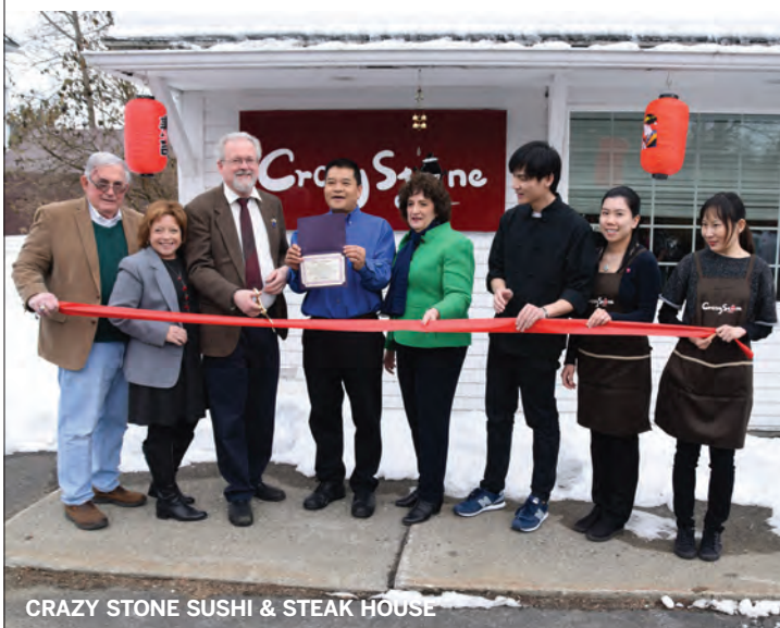
CRAZY STONE SUSHI & STEAK HOUSE