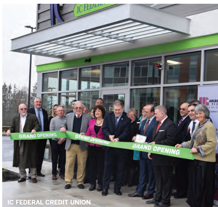
IC FEDERAL CREDIT UNION