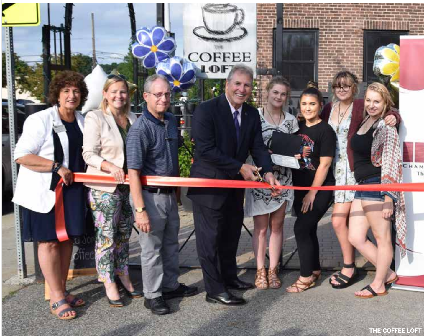
THE COFFEE LOFT