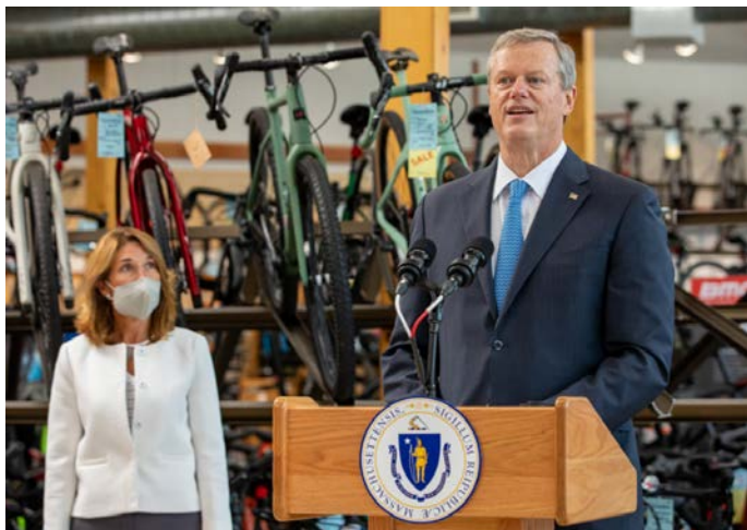
Governor Baker & Lt. Governor Polito announced the "My Local MA" advertising campaign this week to support local business impacted by COVID-19.